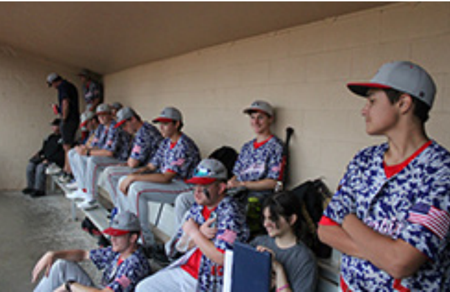
Above, the baseball team hides from the rain in the dugout, after their 15-6 win against UMA-CW. Right, players talk to Coach ????