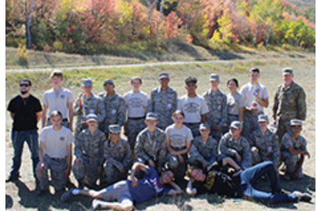
The Rangers team competed at North Fork Park last weekend. The Rangers placed third out of five teams.