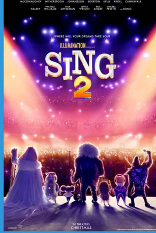
FRIDAY, JUNE 10 PLEASANT VIEW PARK