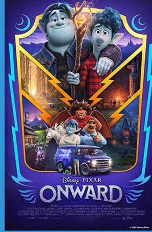
FRIDAY, JUNE 17 NORTH OGDEN PARK