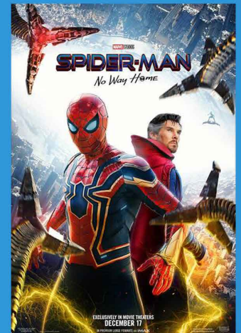
FRIDAY, AUG 5 HARRISVILLE PARK