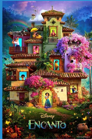
FRIDAY, JUNE 24 PLEASANT VIEW PARK