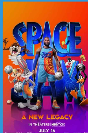
FRIDAY, JULY 29 PLEASANT VIEW PARK