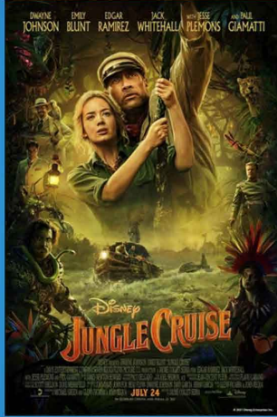
FRIDAY, JUNE 3 HARRISVILLE PARK