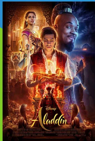
FRIDAY, JULY 22 NORTH OGDEN PARK

**POSSIBLE LOCATION CHANGE DUE TO CONSTRUCTION