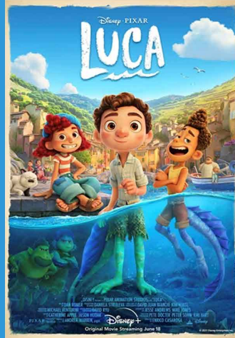
FRIDAY, JULY 1 NORTH SHORE