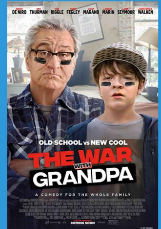
FRIDAY, JUNE 15 PLEASANT VIEW PARK